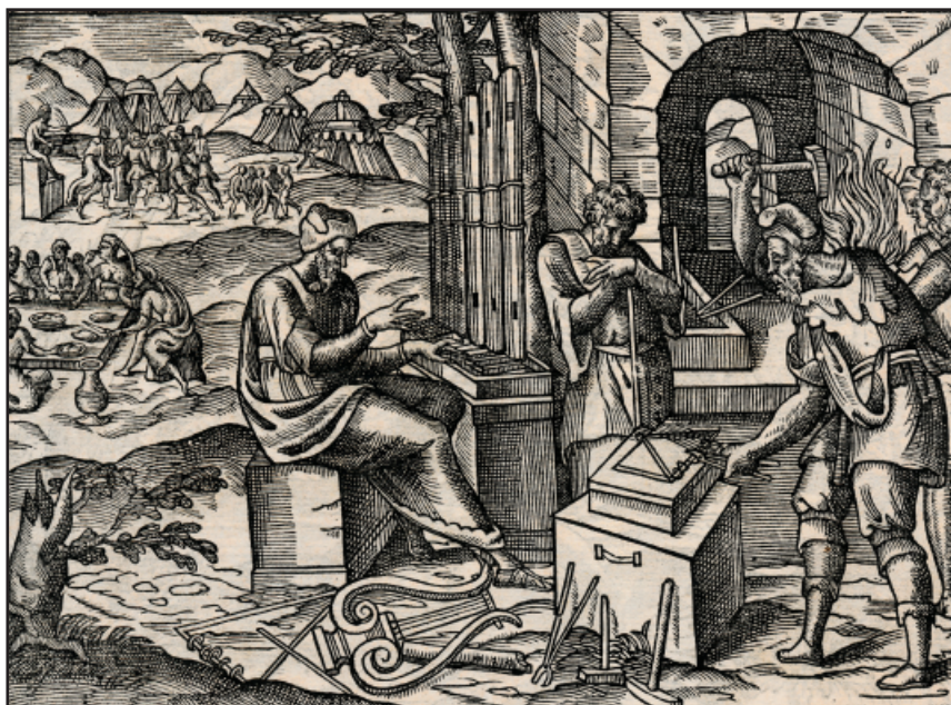
Tubal and Jubal French woodcut, 16th c.

In the 4th chapter of Genesis, the brothers Tubal and Jubal — descendants of Cain — are described as inventors and manufacturers of musical instruments. Jubal is given credit as being the father of all those who play the lyre and pipe.